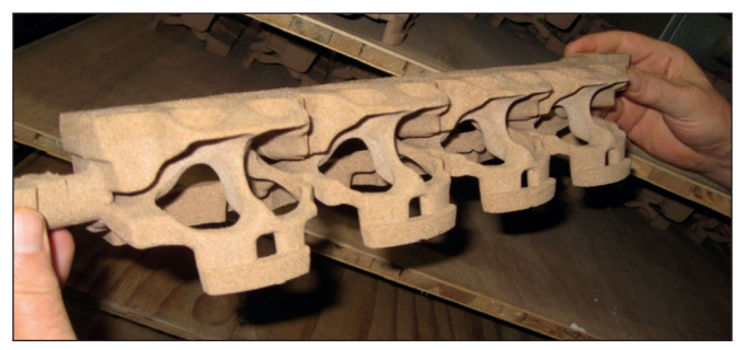
Figure 2. A complicated core design for an automotive casting made in South Africa.

Figure 1. Flow chart of South African aluminum production in 2013.